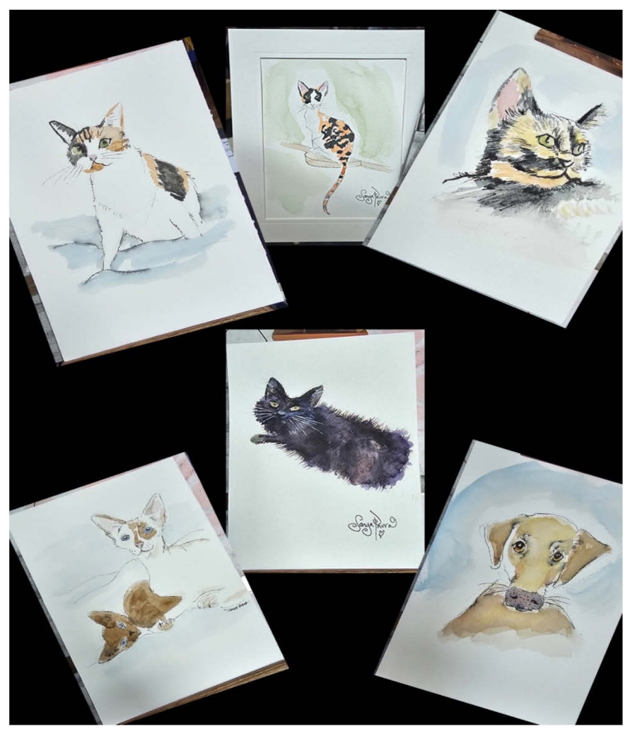
Sonya Parra kindly did quick 5-10 min pet portraits (quick sketches) from photos for a donation of £5